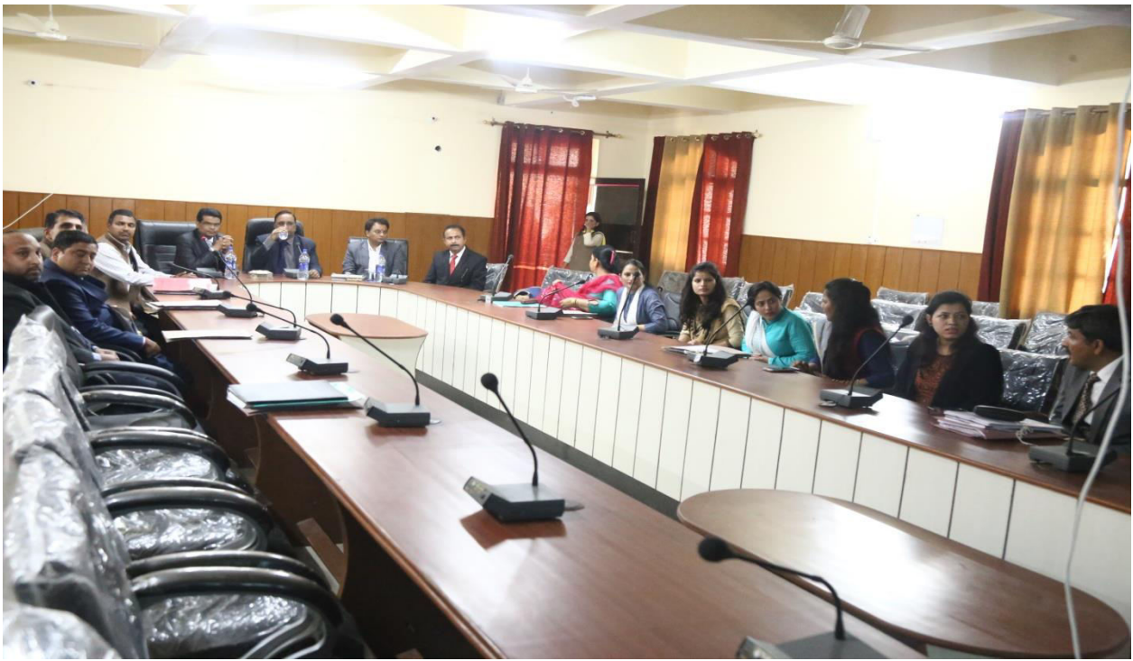
During Interaction with HOD of Departments

The meeting held with Heads of Examination, NSS, NCC, Bharat Scout and Guide, and Student Development. The team had the interactions with Board of Management / Govt. Representative/ College Representative with lunch in Seminar Hall of the college.