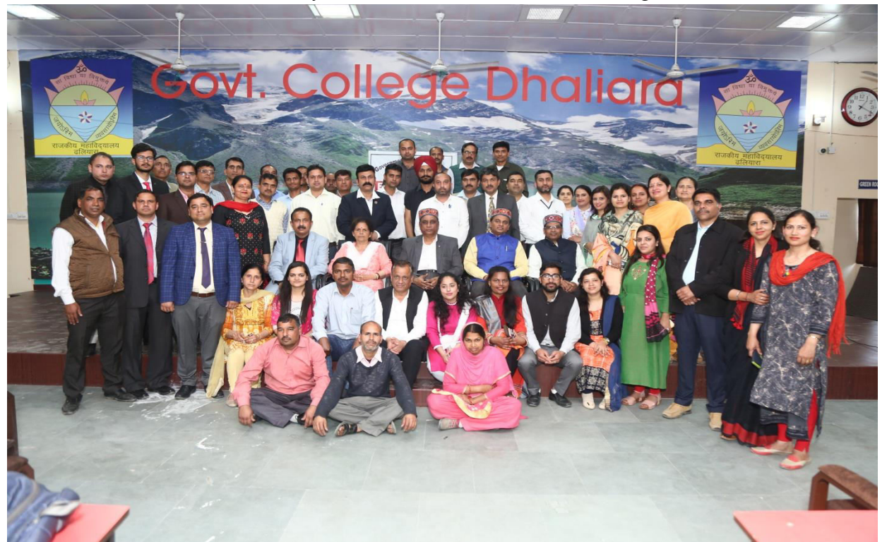
Group Photograph of Staff of Govt. College Dhaliara with NAAC Peer Team